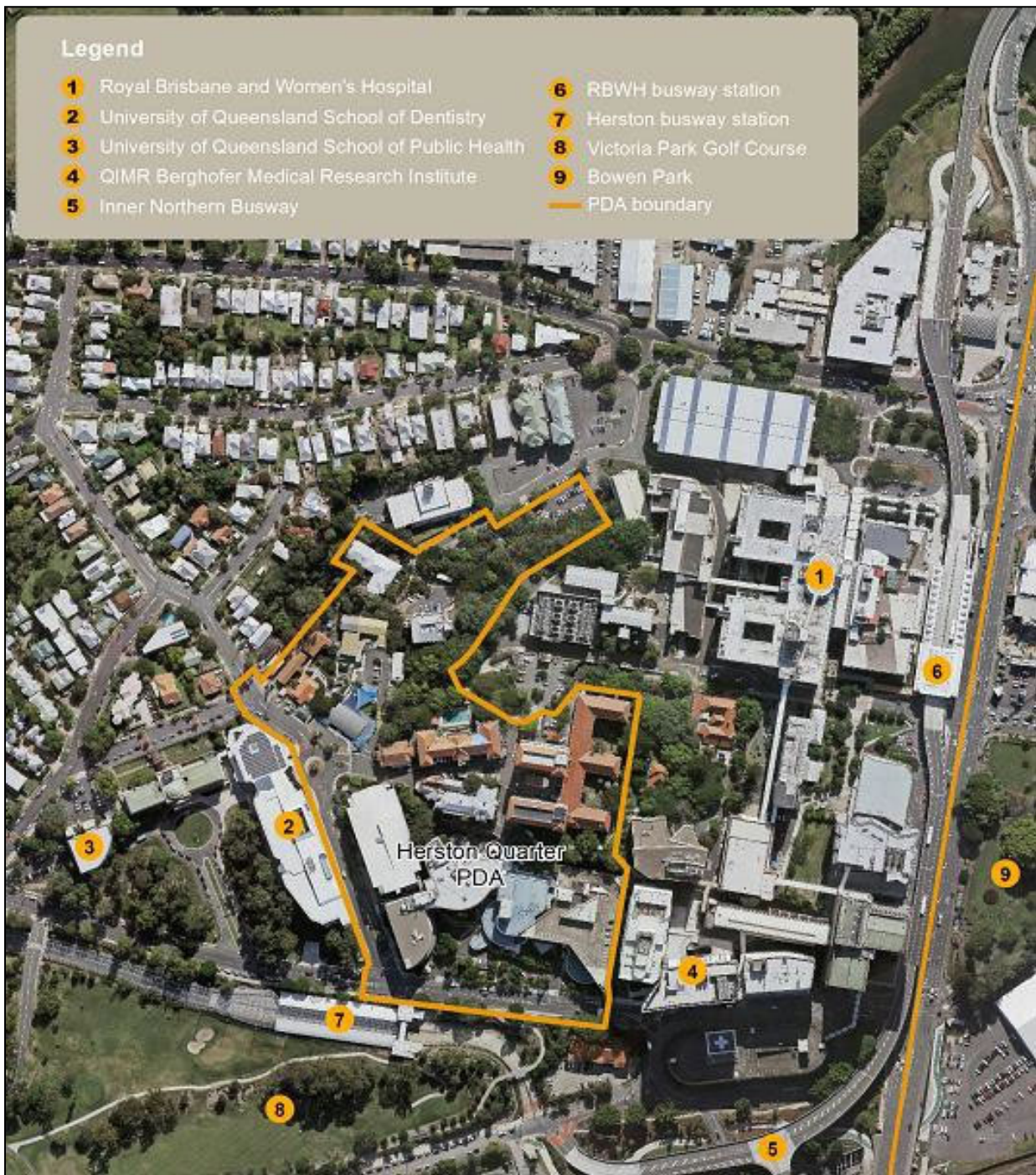
Map 1: PDA boundary